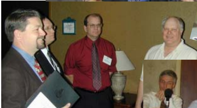
academic needs panel