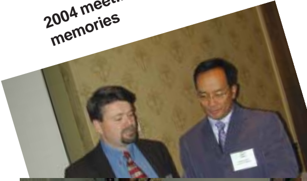
2004 meeting memories